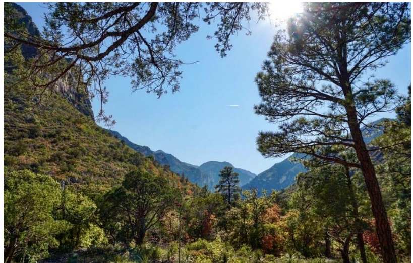
Photos taken of mountain range view and from the Pratt Cabin Trail