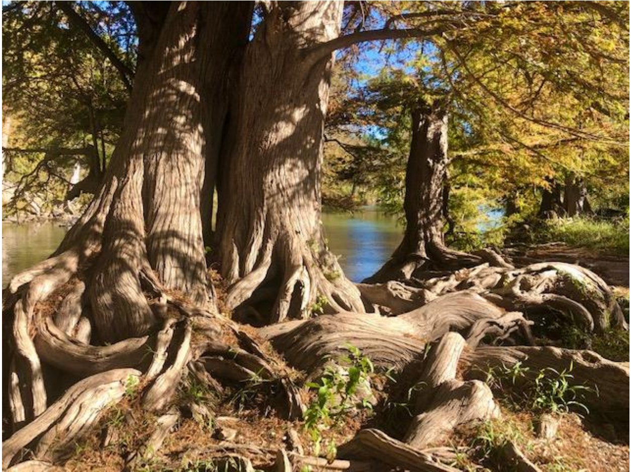
Guadalupe State Park's cypress trees along the river bank