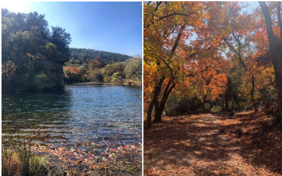
Lost Maples State Natural Area during autumn