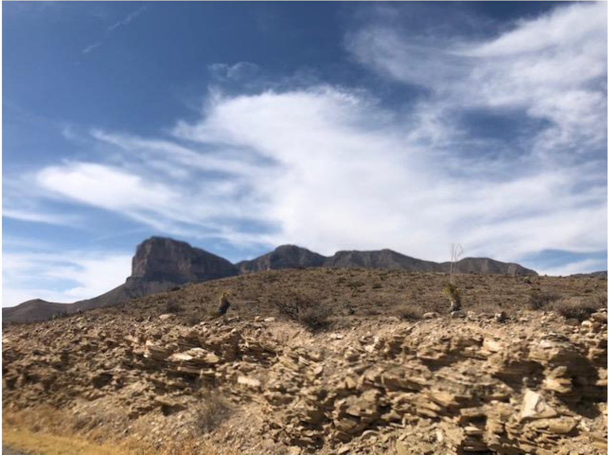
Guadalupe Mts. National Park