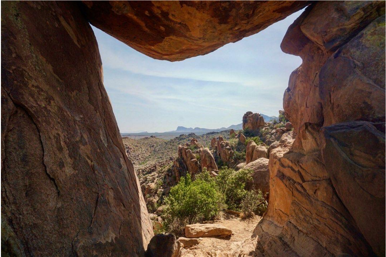
Big Bend National Park