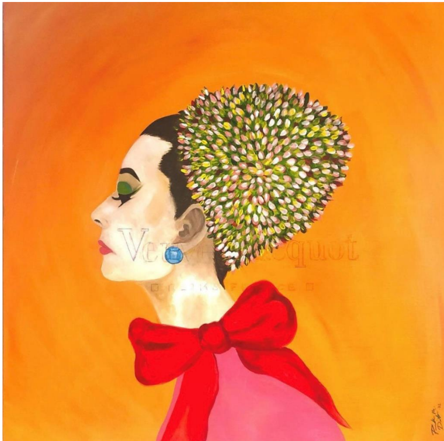
Audrey Hepburn "A Gift" Medium: Acrylic 40x40 on a recycled canvas