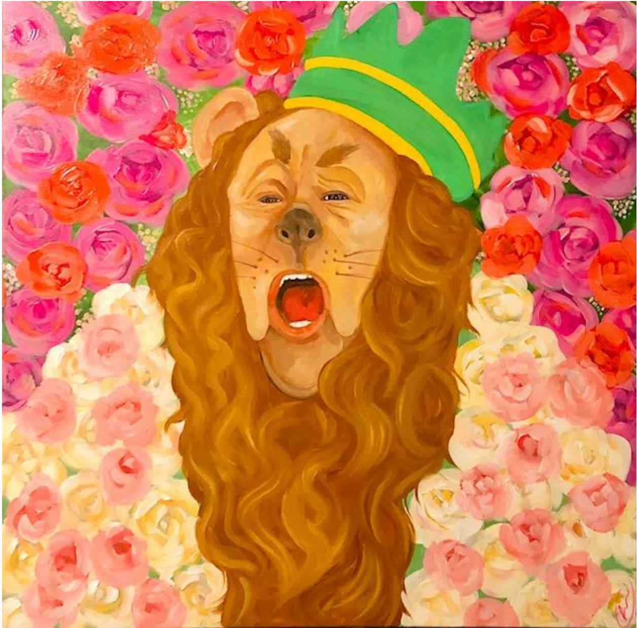
“Pretty in Pink”

Cowardly Lion Painting, Wizard of Oz character