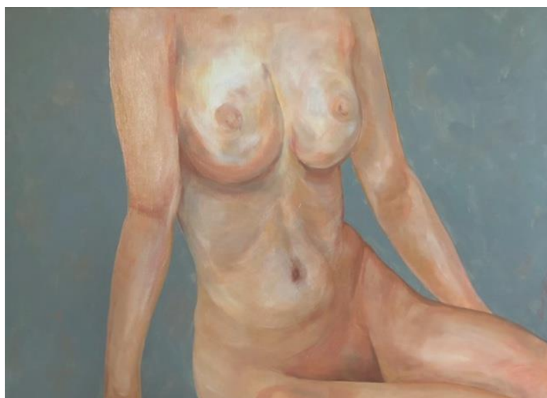
“Blue” figure painting

Reflects topics and quotes ongoingly shared by women from Roe V. Wade overturned