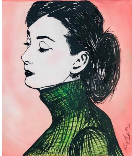
Audrey Hepburn "Breakfast at Tiffany's" Medium: Acrylic and acrylic markers 18x24