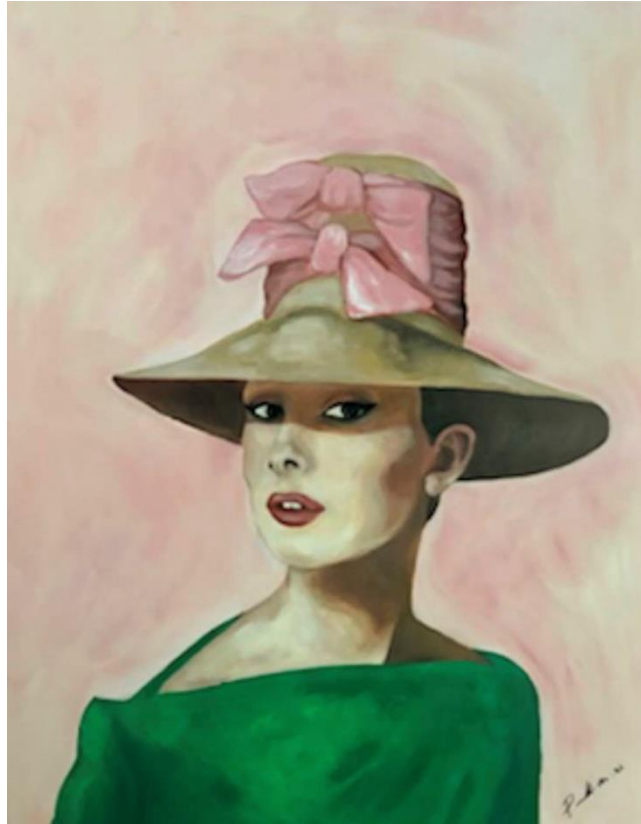
Audrey Hepburn "Brunch Hat" Medium: Acrylic 18x24