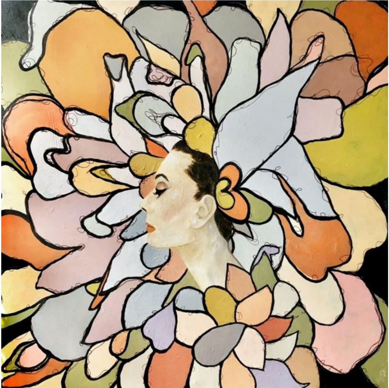
Audrey Hepburn "Desert Flower" Medium: Acrylic 64x64 on a recycled canvas

My first Project of 2021, The many faces of Audrey Hepburn. Hepburn is known as an actress and a fashion icon but not many know that she was dedicated to helping children in need around the world. Her humanitarian work is truly inspiring.