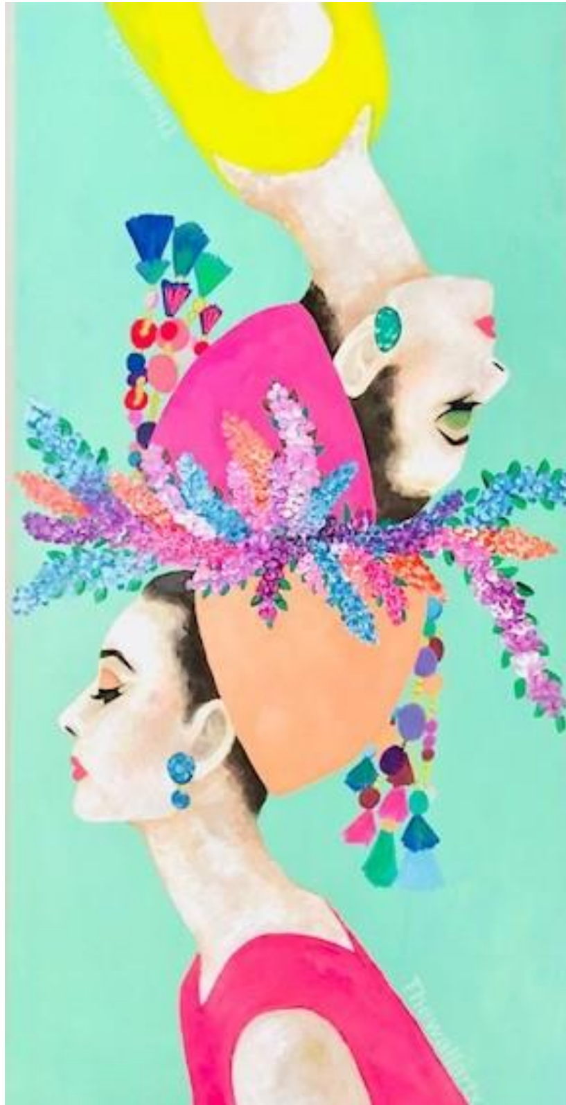
Audrey Hepburn "Fiesta Twins" Medium: Acrylic 24x48