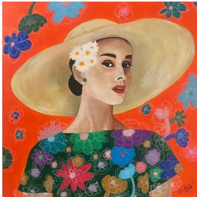
Audrey Hepburn "Blooms" Medium: Acrylic 36x36