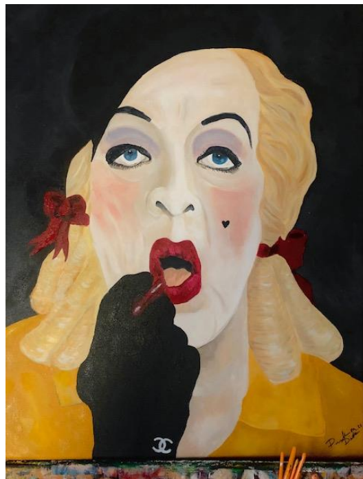
Paintings of Elizabeth Tylor, Betty white and Betty Davis