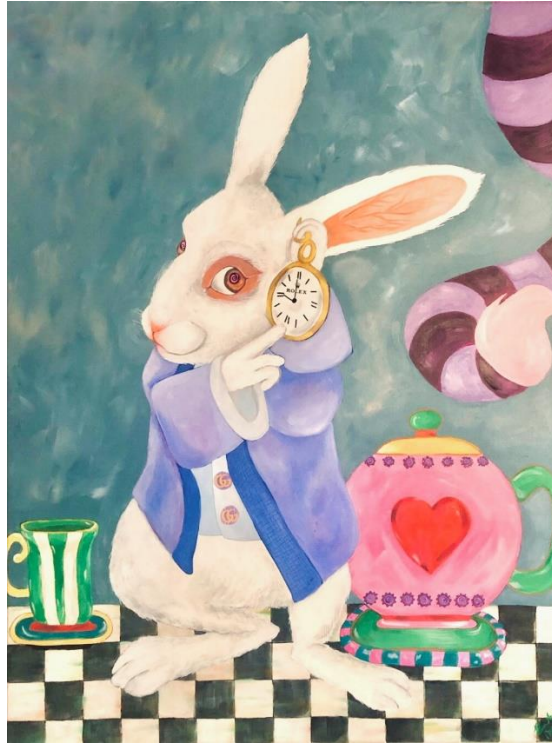
"Late for Tea"