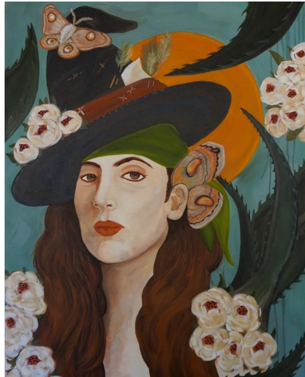
Moth and Moon paintings

Women in bliss amidst a beautiful desert night.