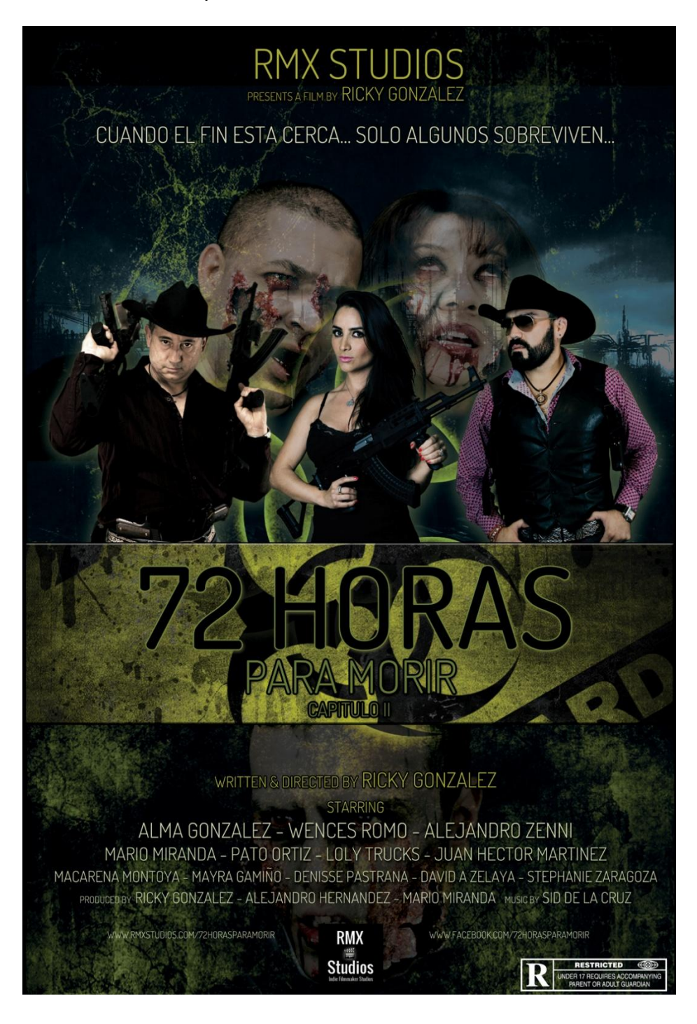
READY FOR DISTRIBUTION

IMDB: http://www.imdb.com/title/tt4450602/