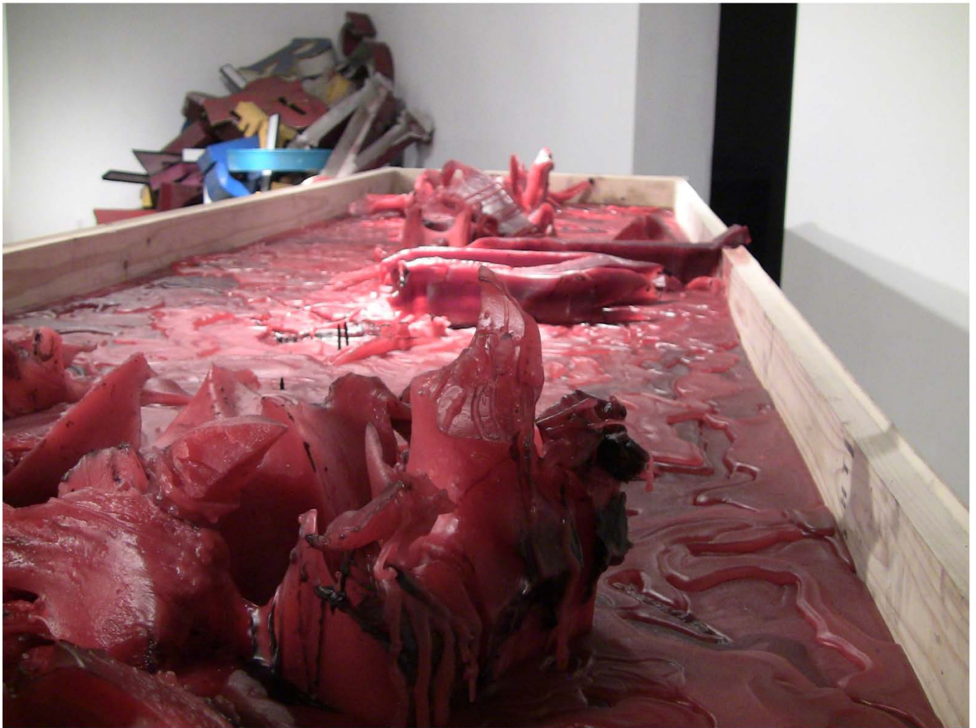
Abandoned Mystery of the Conjunction, 2010– detail exhibition view (after), dimensions variable.