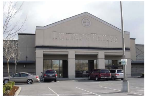
Here's Your Heap – detail exhibition view, metal channel letter 2010. Documentation of channel letters off buildings.