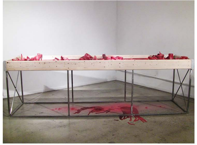
Polarities, Mysteries and Unpredictabilities – detail exhibition view (before & after), 2010, red wax, wood, chicken wire and metal, dimensions variable.

During the 2007-2008 global financial crises, I traveled around Los Angeles taking down and collecting channel letters from corporate and local businesses that went bankrupt. Channel letters are the letters on the front façade of a building advertising the name of a business with either neon or LED lights housed inside metals casing with plastic covering. Some of the businesses included Linens 'n Things, Circuit City, Chevron, Mervyns, and local nail and spa businesses.