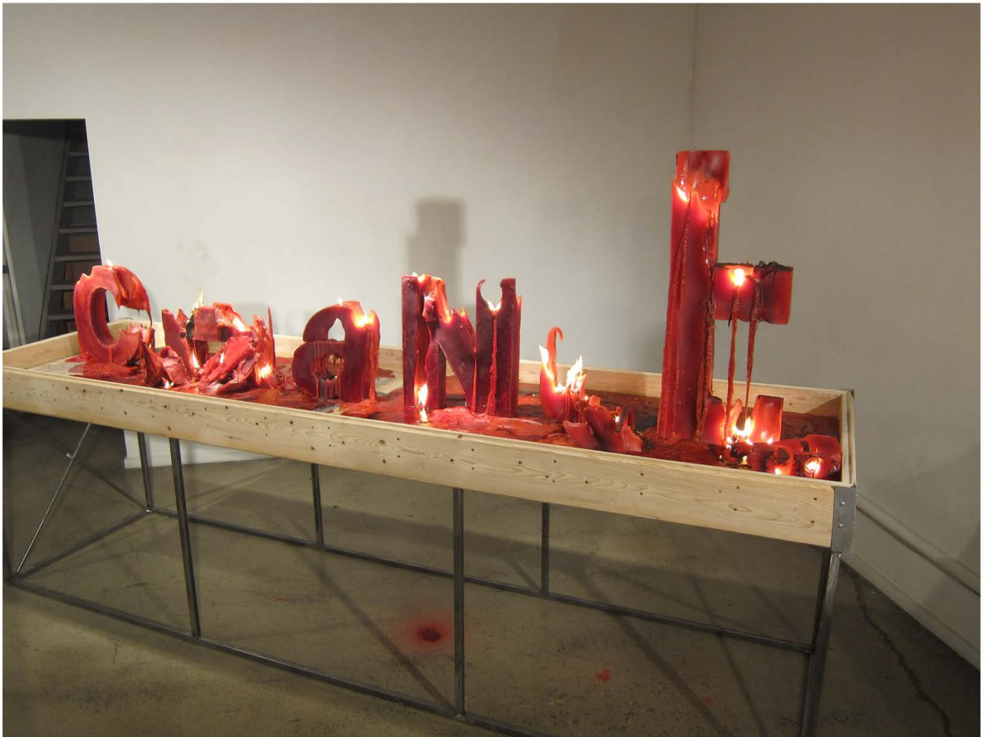
Polarities, Mysteries and Unpredictabilities – detail exhibition view (before), 2010, red wax, wood, chicken wire and metal, dimensions variable.