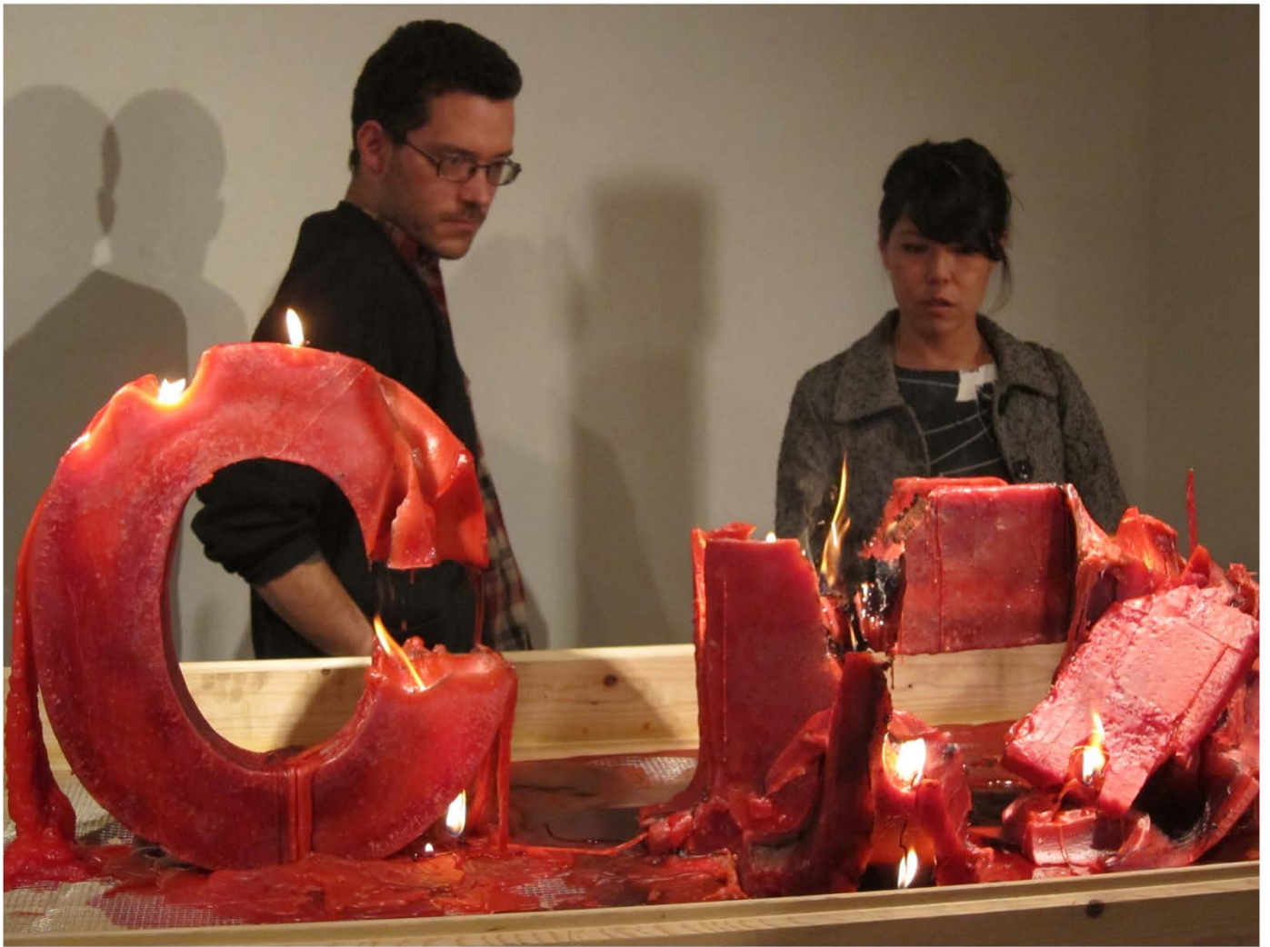
Polarities, Mysteries and Unpredictabilities – detail exhibition view (before) , 2010, red wax, wood, chicken wire and metal, dimensions variable.