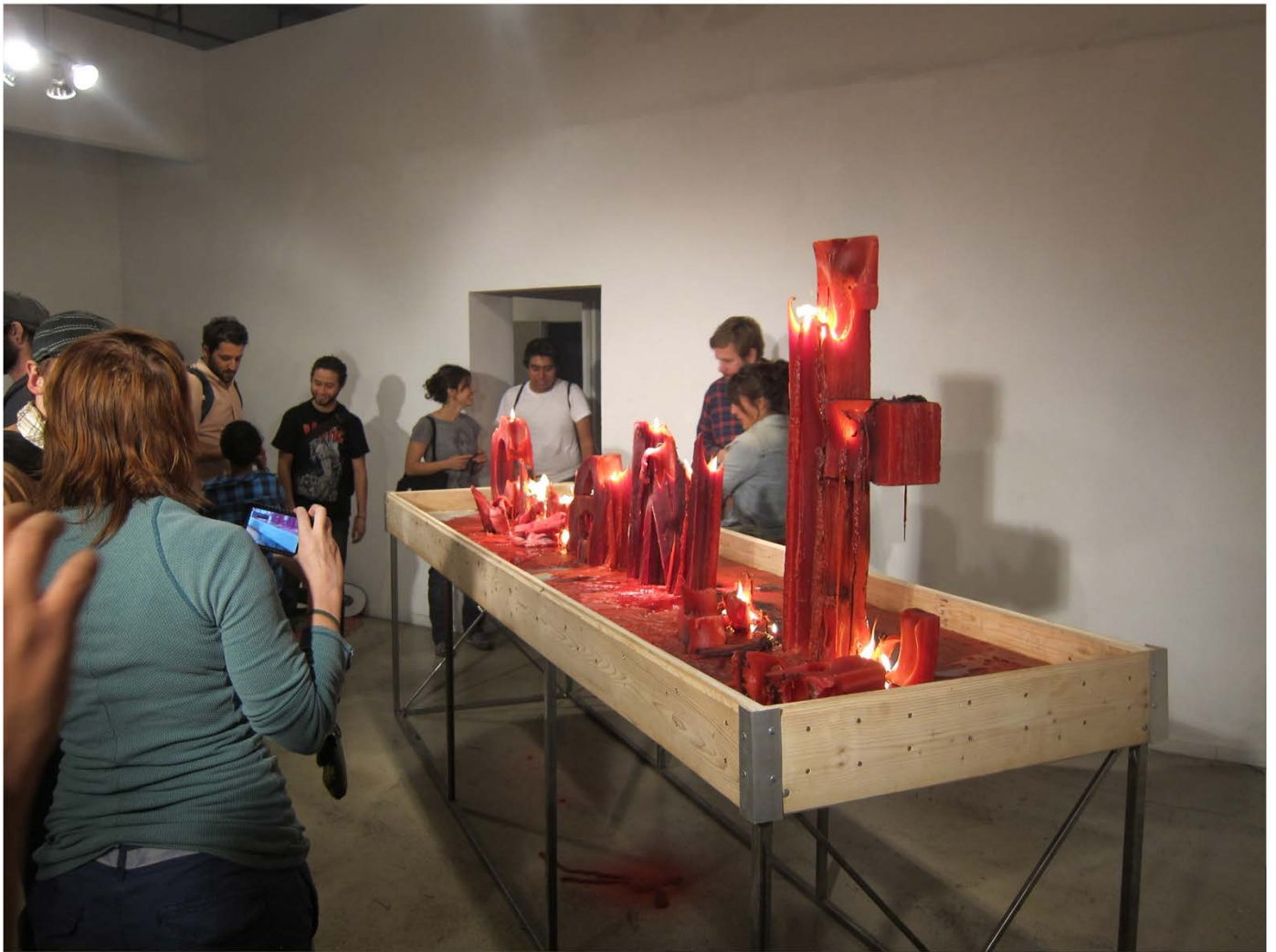
Abandoned Mystery of the Conjunction,, 2010– detail exhibition view, dimensions variable.