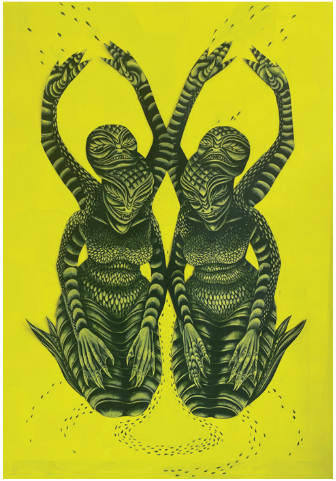
Bayou Witches, acrylic on paper, 60" x 48", 2023