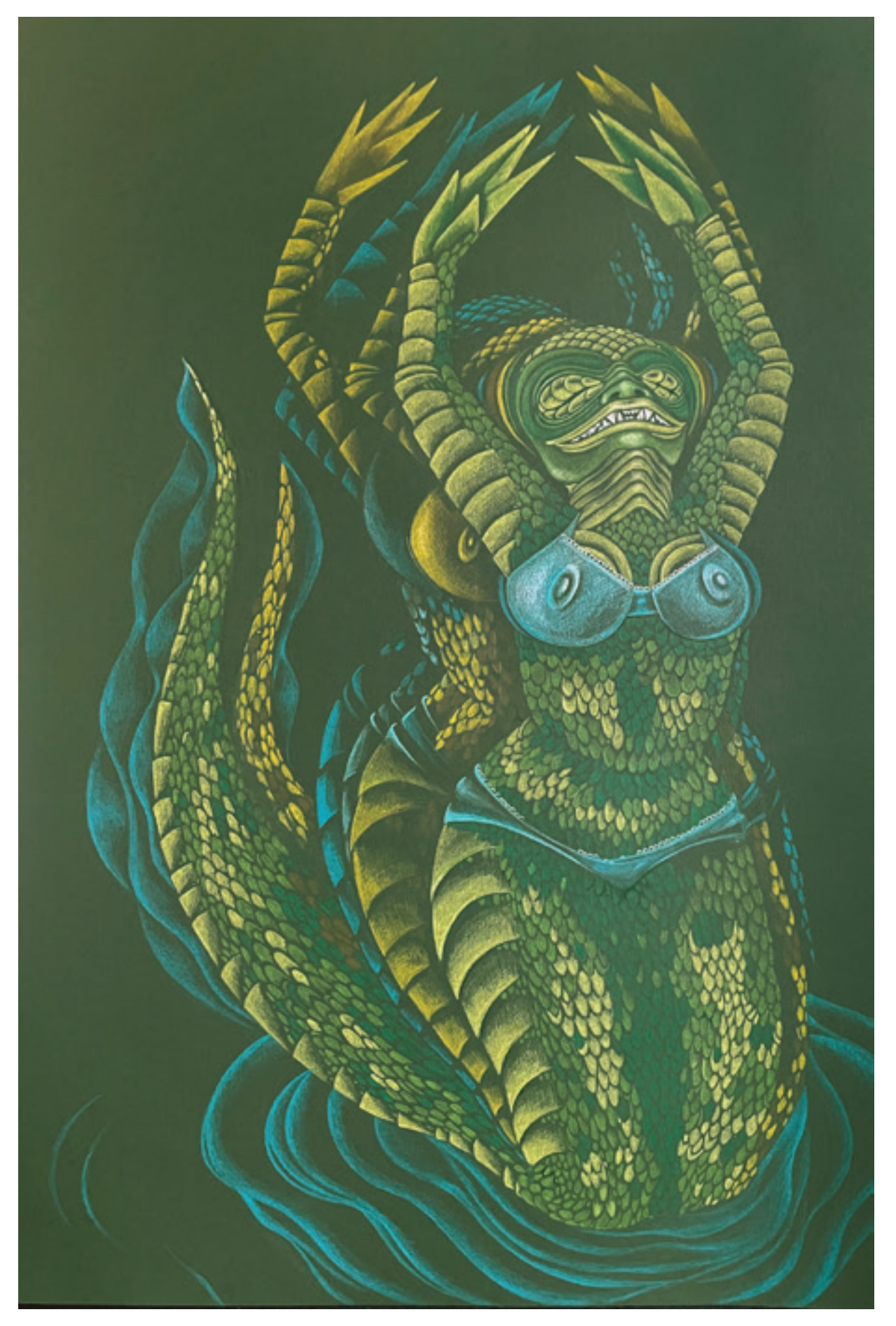
Shed, colored pencil on paper, 24" x 34", 2023