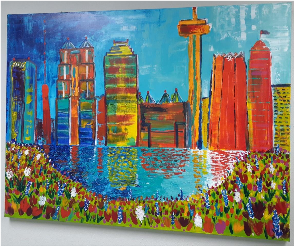
Lights on the River Stage-30 x 40 x 1 Acrylic on Canvas- Sold for $300- December 2022