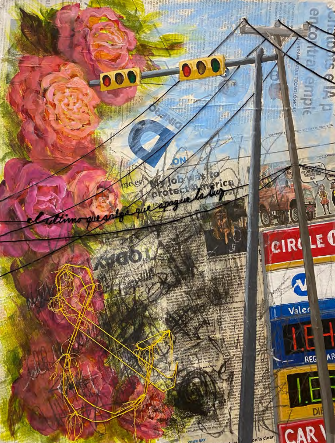
El Ultimo que Salga que Apague la Luz / The Last One Out, Turn off the Light 24 x 18

Acrylic paint, newspaper, charcoal, and thread on canvas. 2021