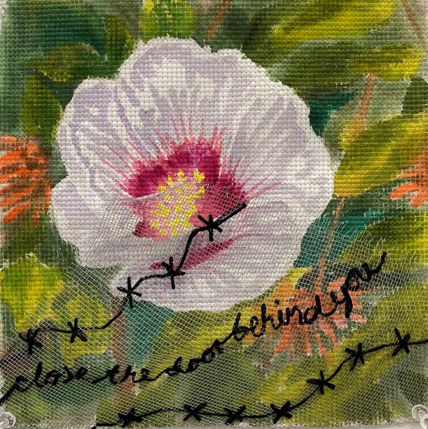
Close the Door Behind You

8.5 x 8.5 in Acrylic paint, thread, and wire mesh on Aida cloth. 2021