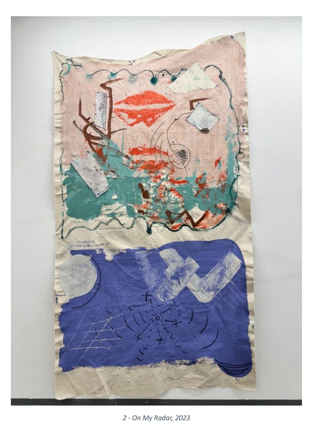
House paint and charcoal on canvas.