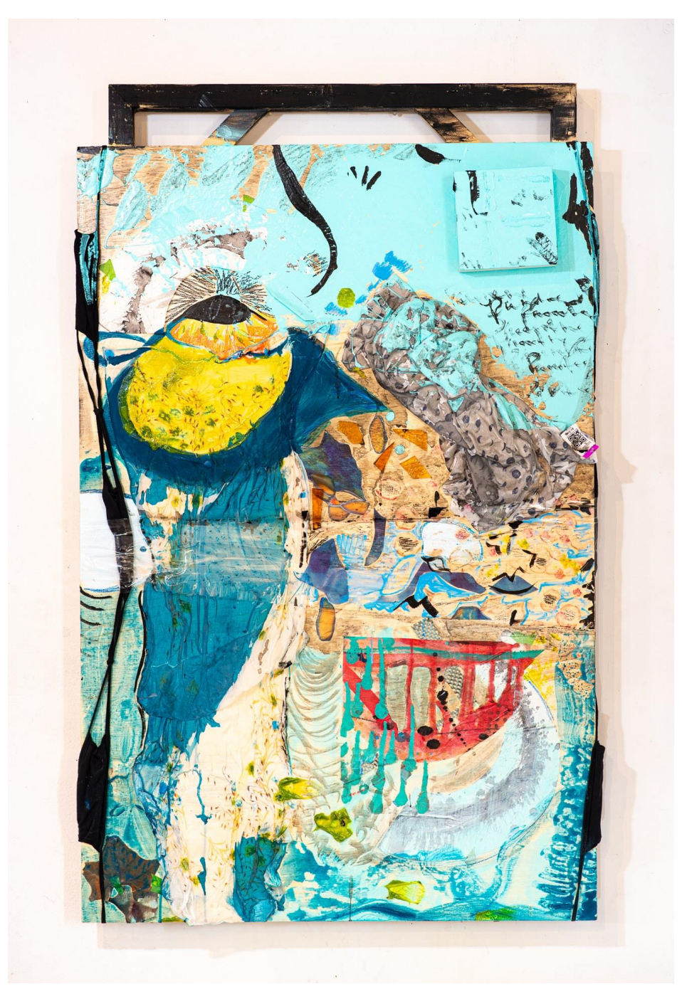
6 - Make Amends, 2023

Acrylic, fabric, glass and mixed media on panel.