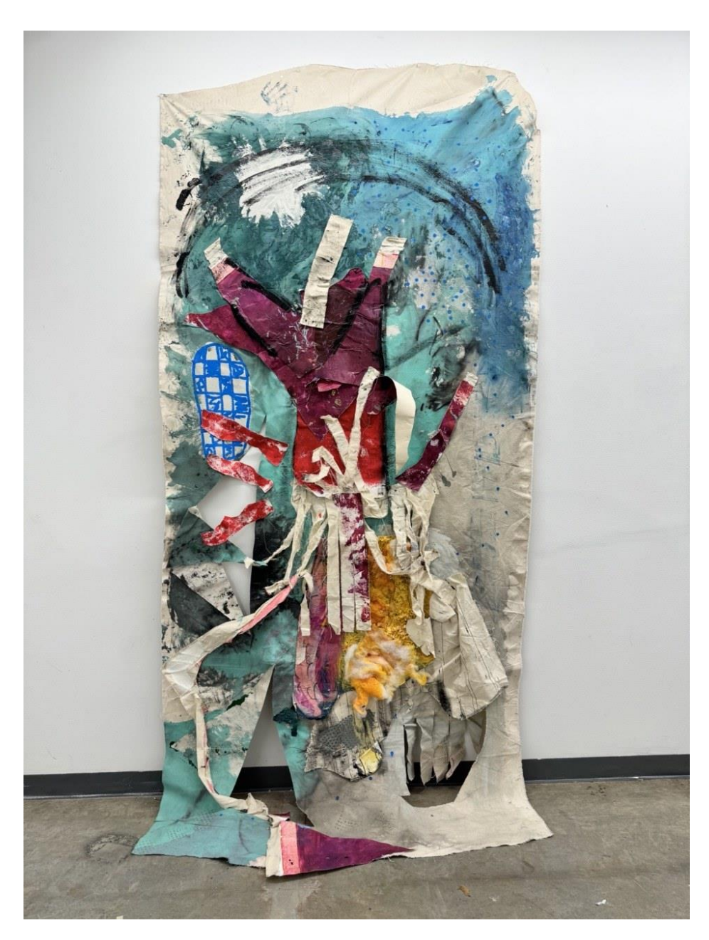
3 - Reach You, 2023 Acrylic, house paint and mixed media on canvas.