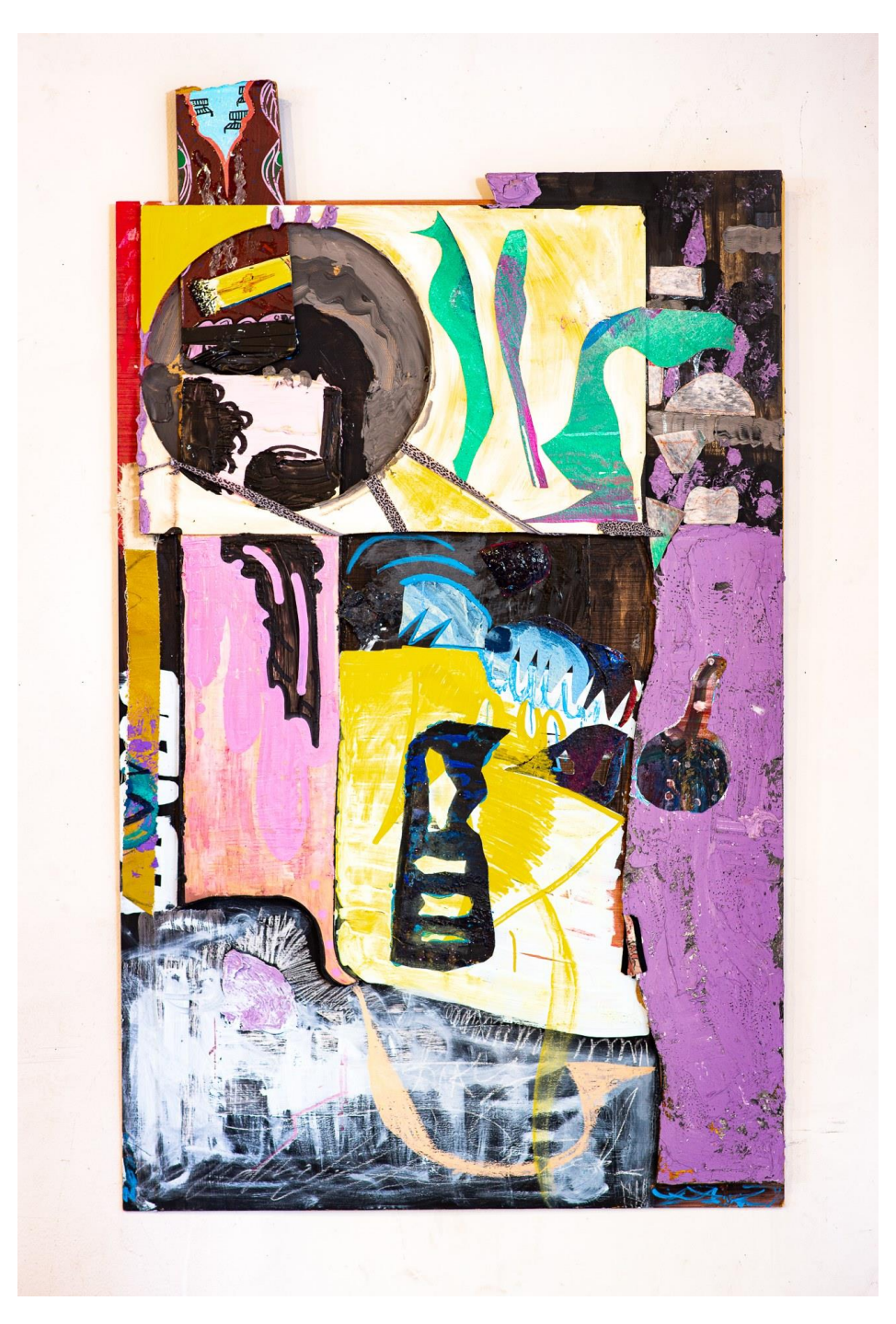
9 - Untitled, 2022 Acrylic and canvas on panel. 36 x 52 inches