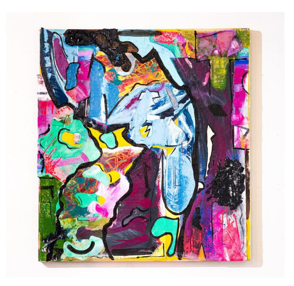
7 - Tenacity, 2022