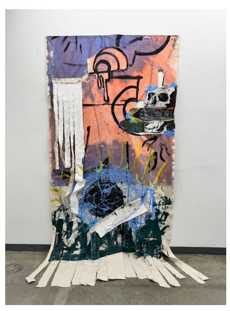
4 - Rent Free In My Head, 2023 Acrylic and house paint on canvas.