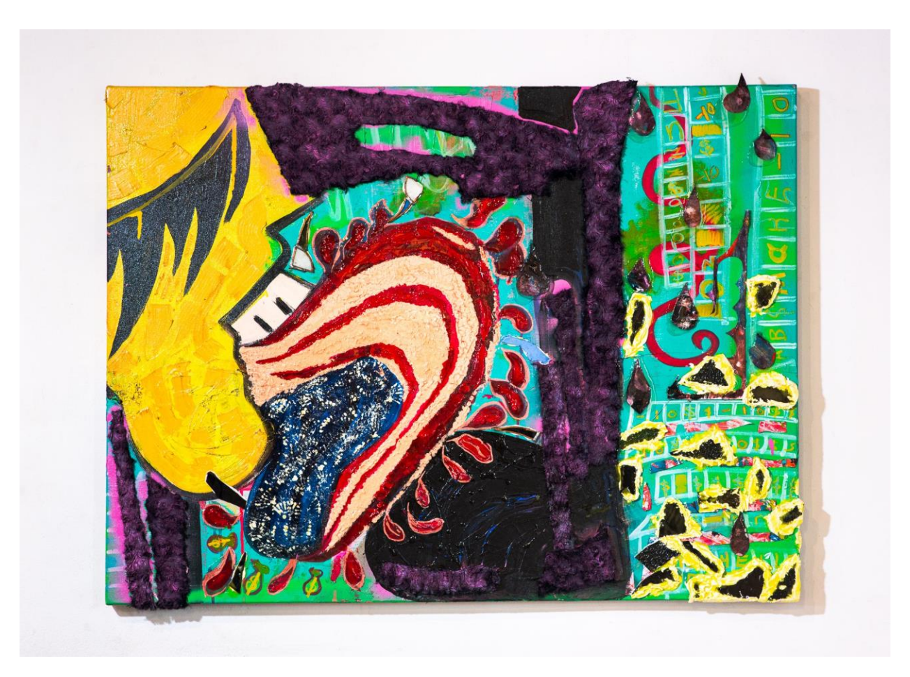
10 - Bootlicker, 2022

Acrylic, glass, and mixed media on canvas