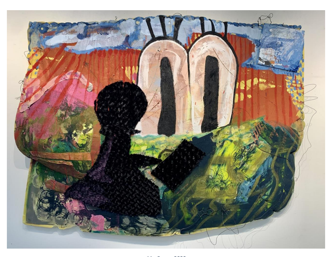
11 - Pawn, 2023

House paint, wood, and wire on foam mattress.