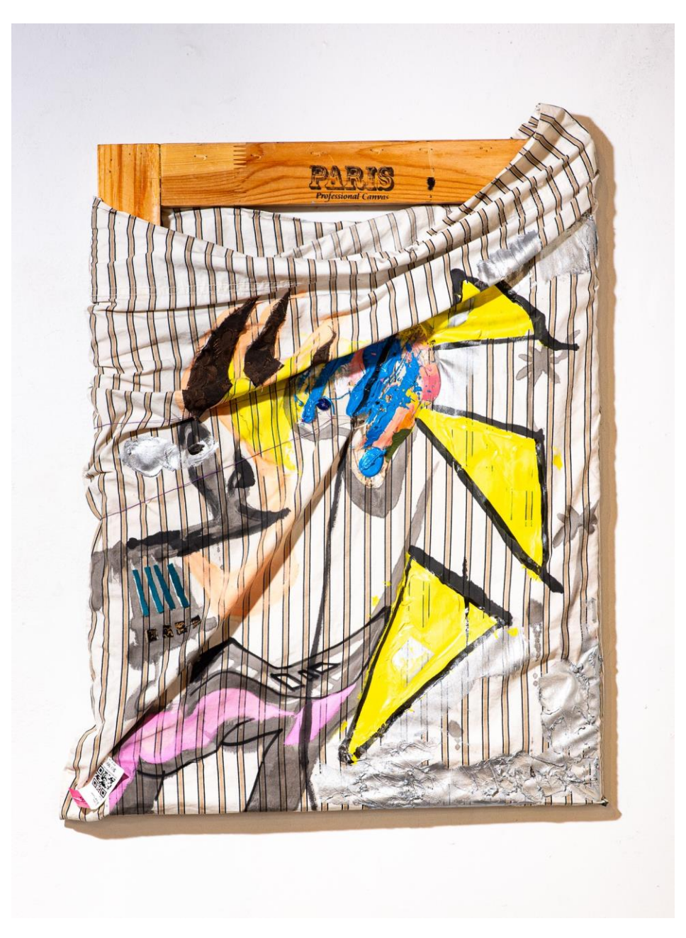
12 - I'm A Professional, 2023