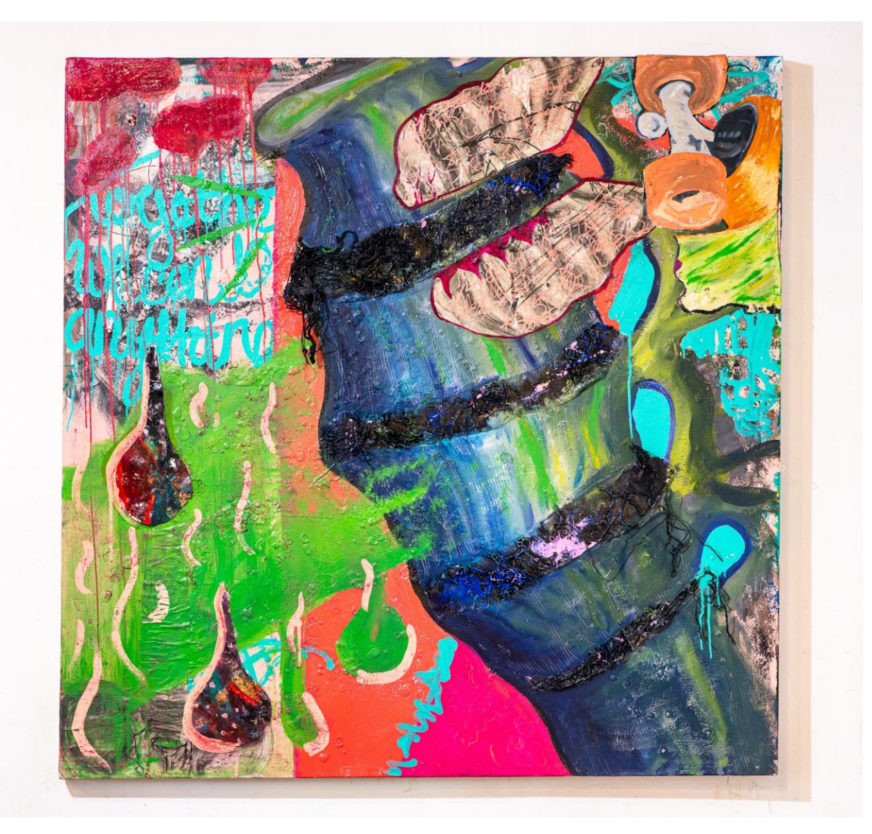
13 - Cordless (Together, We Can Do Anything), 2022 Acrylic, oil, and mixed media on canvas.