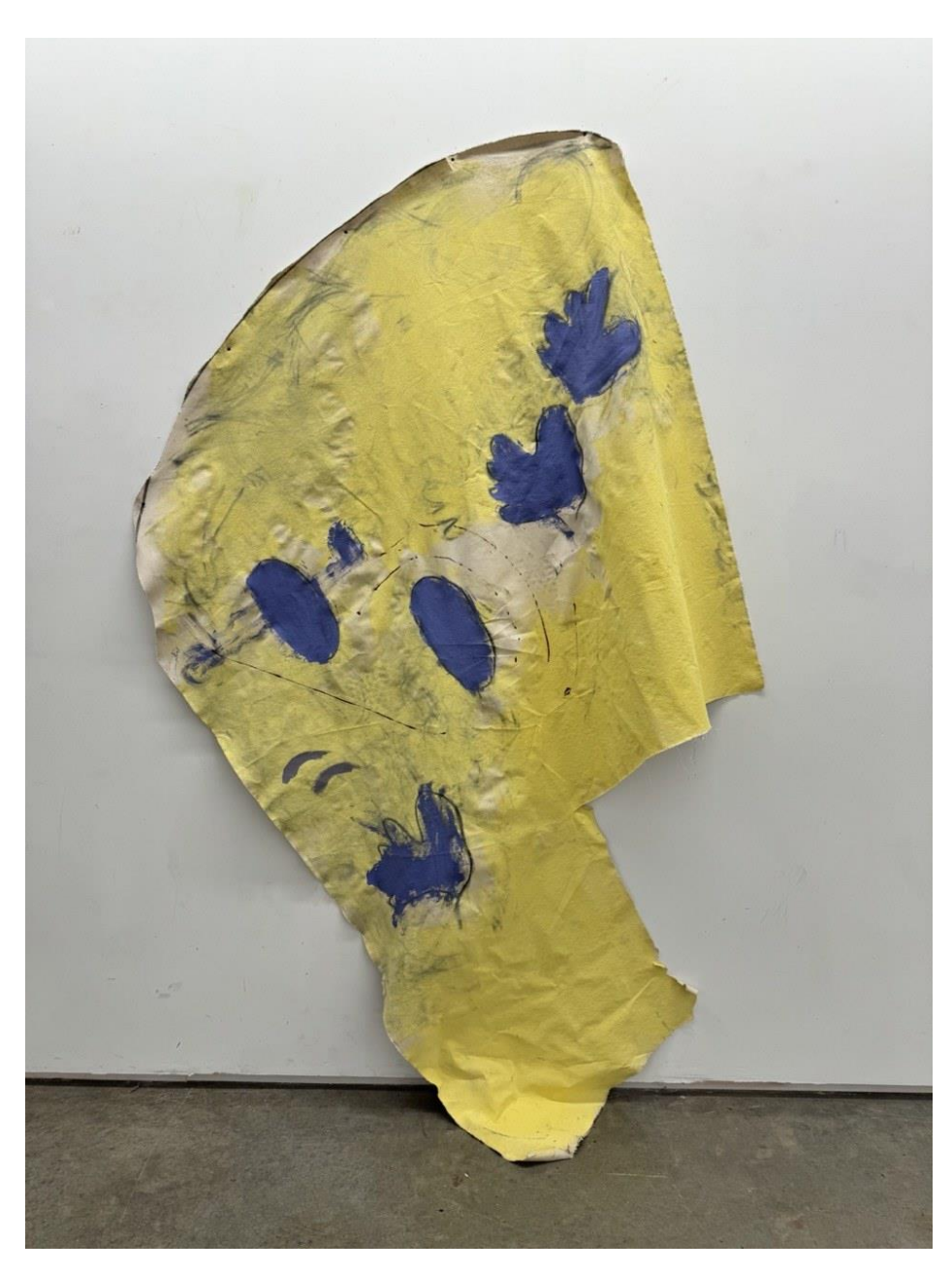
5 - Sands Of The Glass, 2023 House paint and charcoal on canvas.