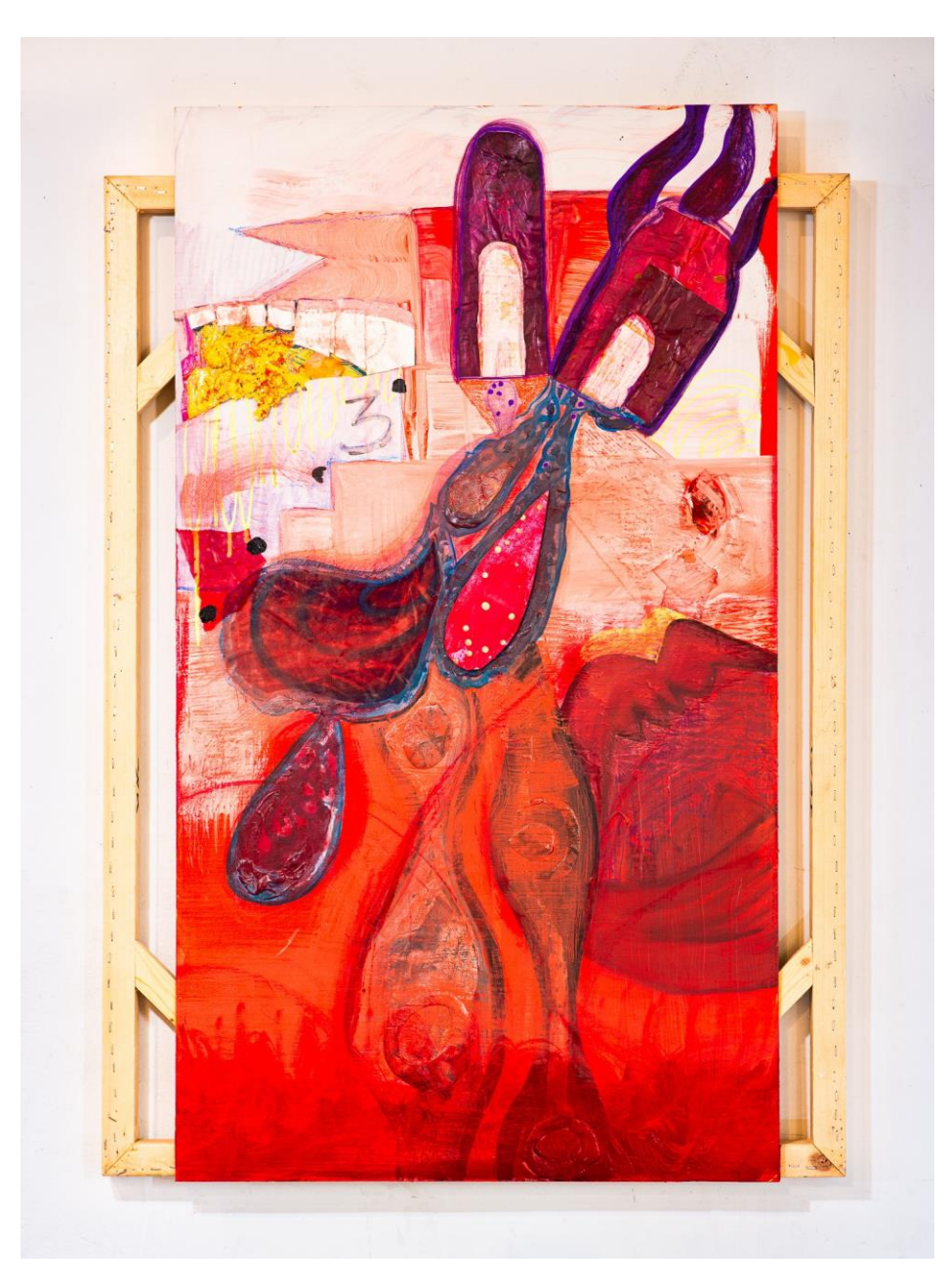
8 - Red Flags, 2023 Acrylic and mixed media on panel.