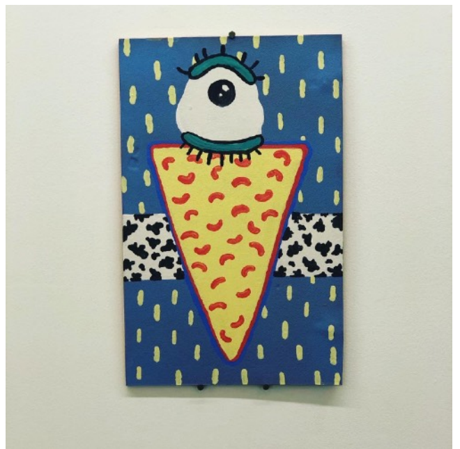
Physical Challenge SLIME TIME Ceramic Camayuhs, Atlanta, Georgia 2021