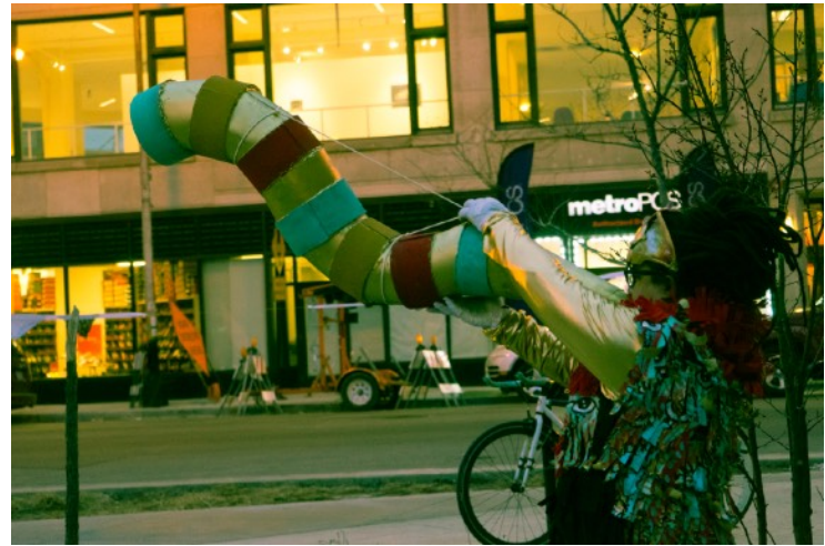
A Moises Imbatchi Experience Ceramic and performance Second Floor Rear Festival, Chicago 2016