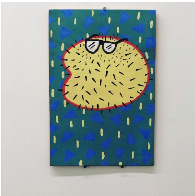
Camera Shy SLIME TIME Ceramic Camayuhs, Atlanta, Georgia 2021