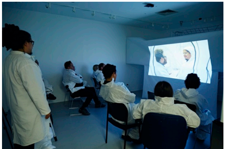
Time Travel Collaboration Assorted Time Travel Sessions from The ARCHive Performance, ceramic, ink on paper School of the Art Institute of Chicago 2018-2019