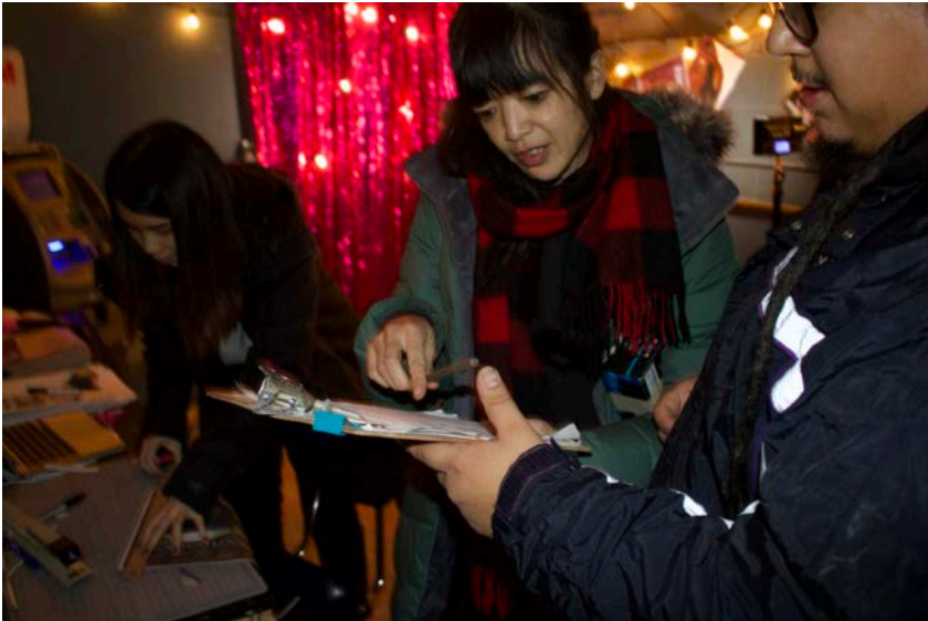
FedEx Fedup- A day in the life Performance New Blood Performance Festival, Links Hall Chicago 2019