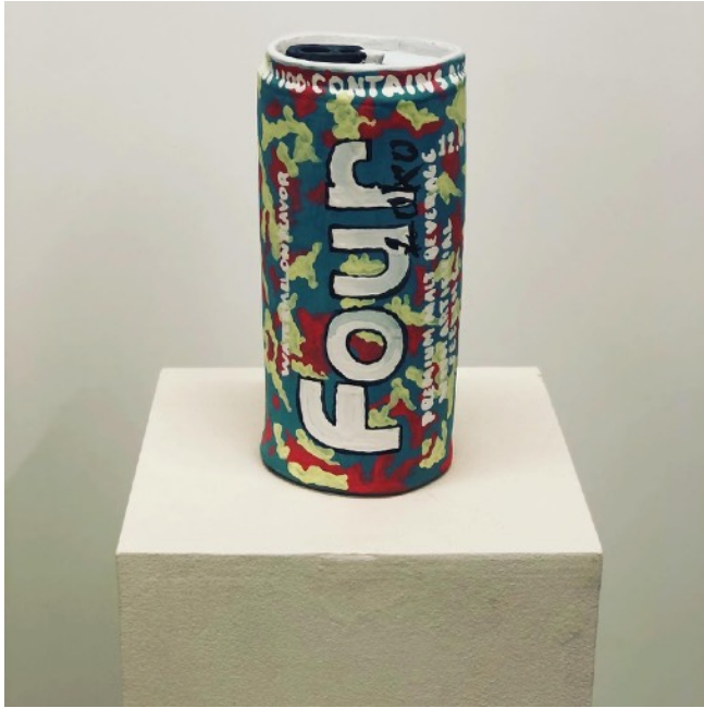
Artificial Feeling SLIME TIME Ceramic Camayuhs, Atlanta, Georgia 2021